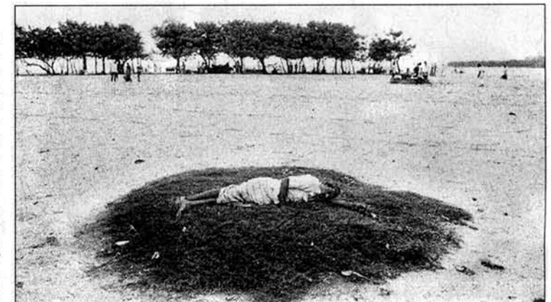
■ A man asleep at Chowpatty in the 80s. The beach wears a different look now