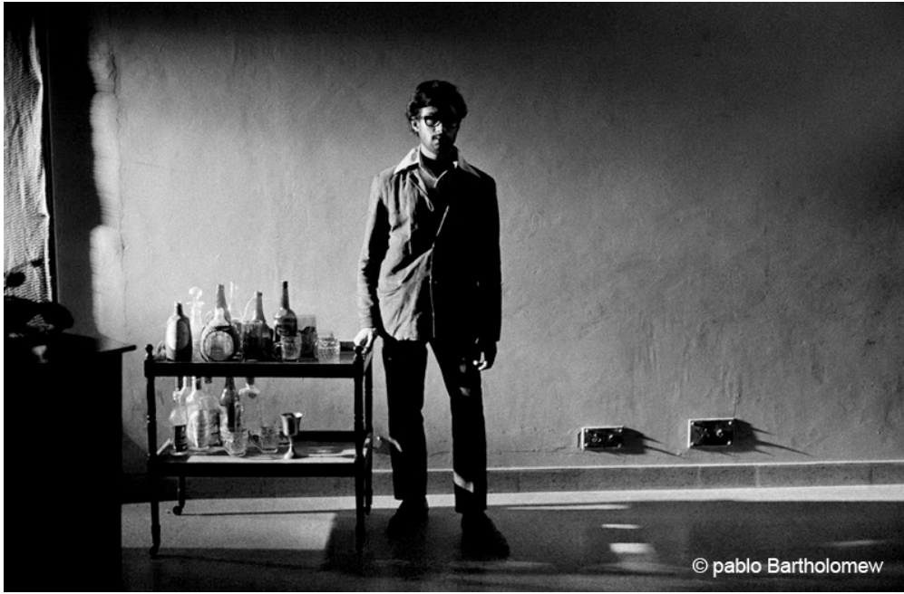
? 2010 - Orange Photo Festival. All Rights Reserved.