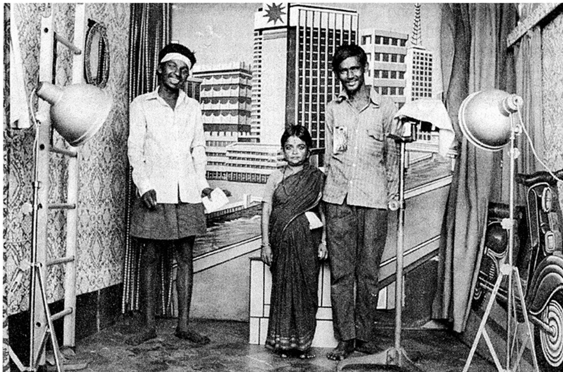
Roadside photo studio