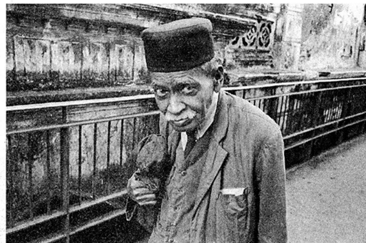
Man with a bag