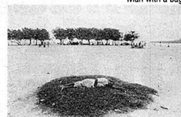
Man asleep on Chowpatty beach (II)

Something about the images of tall buildings covered in chipped plaster, dilapidated repair shops, deserted streets and wrinkled faces, hold your attention.